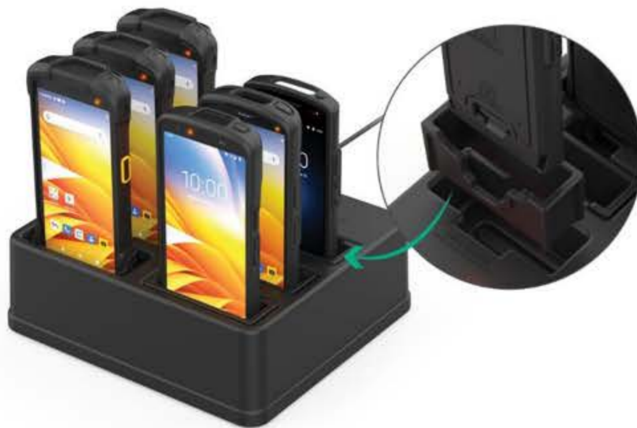
3PTY-RAM-GDS-DOCK-6G15P GDS® 6-Port Charging Dock for Zebra Handheld PCs with IntelliSkin®