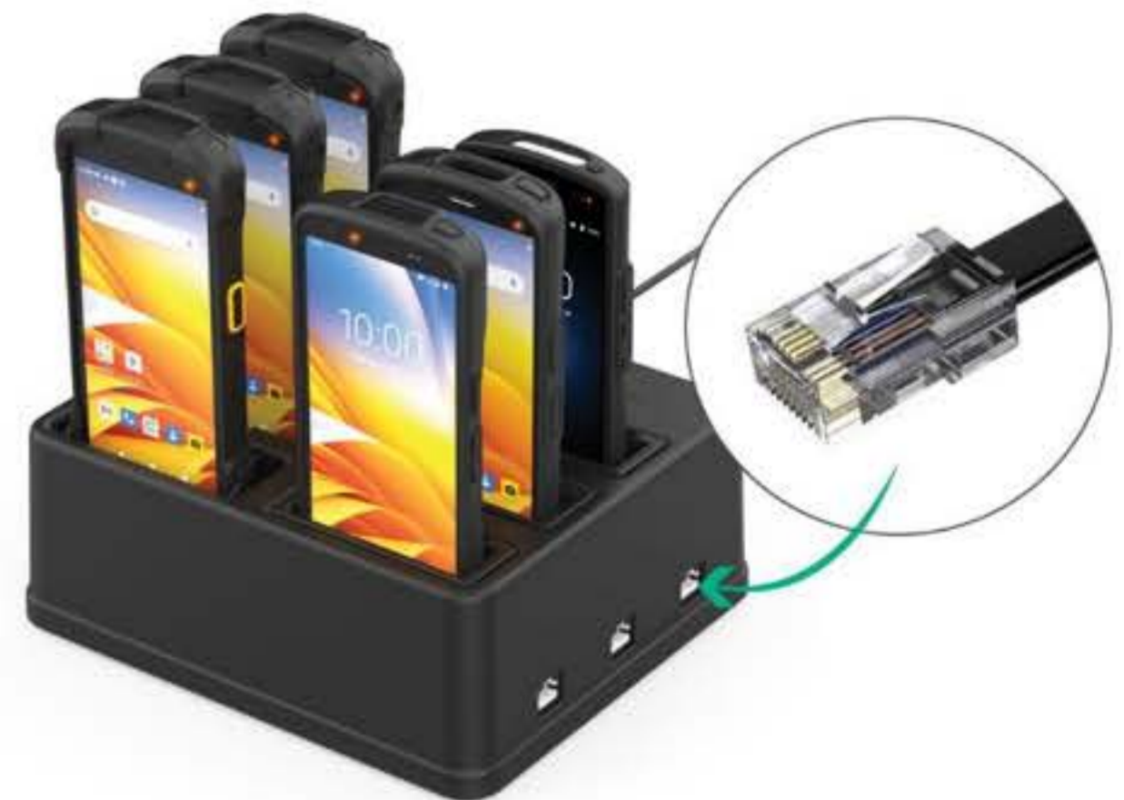
3PTY-RAMGDSDOCK6G15PRJ45 GDS® 6-Port Charging Dock with RJ45 Ports for Zebra Handheld PCs with IntelliSkin®